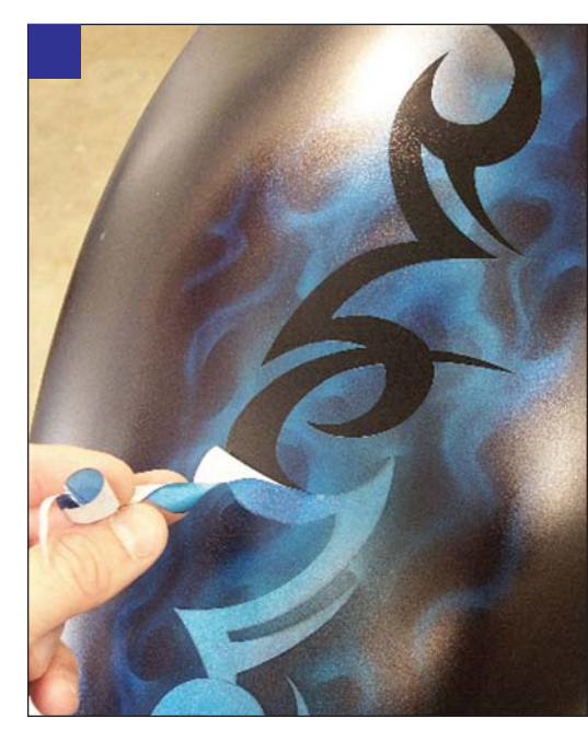
STKP With the kandy spraying completed, I carefully unmasked the tribal to reveal the black-on-black design. The great advantage that Automask (and other transfer tapes) holds over standard masking tape is that you experience little or no glue residue from Automask, and you don't have to worry about tape tracking from the solvents inherent in standard masking tape.