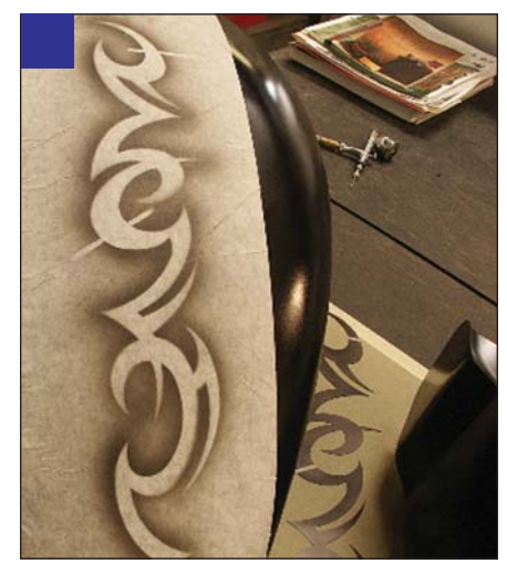
After removing the stencil, notice how just a little basecoat black is all you need to transfer the tribal design to the masked surface. Believe me, this method is much faster and cleaner than using a pencil or carbon