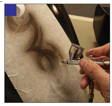
After prepping the surface—including cleaning it with a little soap and water—I masked the tins using AutoMask from Coast Airbrush. After selecting the Tribal Master of choice, I taped it to the AutoMask and fogged in paint with an Iwata Eclipse CS to establish the initial layout.

I WAS COMMISSIONED BY ARTOOL TO DESIGN A SERIES OF TEMPLATES TO EMULATE MY tribal designs that I've used for years on various projects. Artool has done an excellent job of reproducing these designs. Tribal Master combines a set of linear stencils, called Tribalnometry , and circular stencils: Cirque Du Trible . Whenever I'm asked to create a tribal design on a bike or something small or tight, I make templates to aid in the layout. These templates are often made of Pellon fabric. While Pellon is excellent for easy cutting and designing one-off stencils, it's definitely not as durable or accurate as a piece of laser-cut acetate. The following how-to shows a simple application of freehand technique and stenciling. Using Tribalnometry , the linear templates from Tribal Master , I completed an entire kustom paint job on a set of chopper tins. The sky's the limit with these stencils. I could create literally thousands of different designs with just these three stencils! Keep in mind that this demo shows only one application of these versatile stencils. In the future, I'll show many more tricks with the other stencils in the kit. Hope you like it!