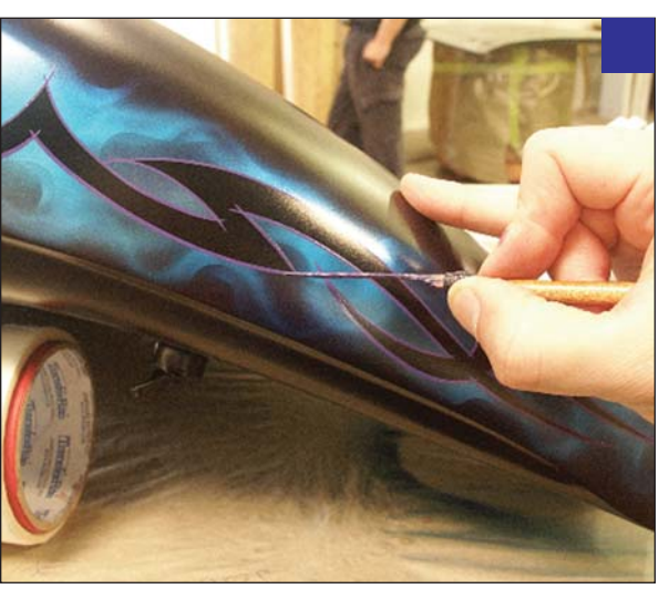
Before clearing this project, I pinstriped the graphic's outline with a mixture of House of Kolor Lavendar striping urethane. This stylized stripe really gave the design extra pop.