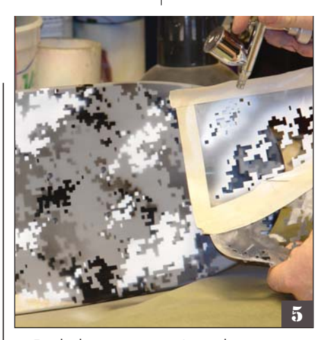
5. For the biggest contrast, I mixed up some pure BC-26 white. This will really make the design pop, not to mention making it hard to focus on. (Don't worry; it's supposed to be hard to focus on. That's the point). Just be careful of the overspray. You want the pixels in this pattern to remain crisp, giving it that modern digital look.