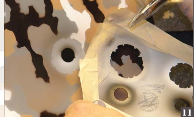
11. Spray just a little black through the hole, and you have one realistic bullet hole. I normally would add smoke, but with all the camo patterns in this board, the smoke would probably not come across very well. These bullet holes will work for me just as they are.

18 AIRBRUSH ACTION I JULY-AUGUST 2008 STENCIL