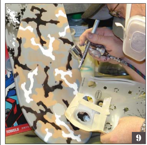
9. Here you see the flow of the two camo patterns with the Ying-Yang line separating them. For the eye at each end, I decided to use my Bullet-Riddled stencil from a while back; the entrance hole is signified by the radius of chipped paint, showing the metal under the camo paint. I got this metal effect with a little Kosmic Krome Aluminum effect, MCC-01.