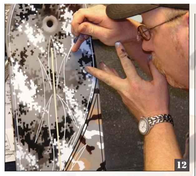
12. I know, I know—Von Dutch striping is not your standard camo pattern; but, heck, it screamed for it! Not only does it center the board nicely, and add a killer touch, but it outlines the Ying-Yang pattern and really punches the design out nicely.