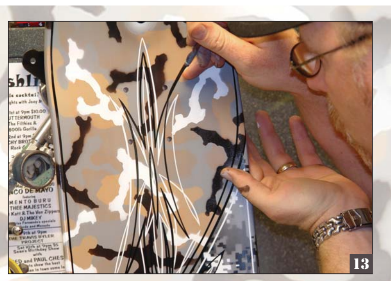
13. In keeping with the balance and color schemes, I predominantly stripe one side with white, and the other with black, tying both in together on the center-line with Von Dutch work. I think that is enough Von Dutch. I wanted just enough Von Dutch to work with the camo, but not overpower it.