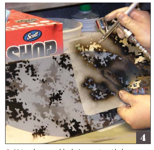
4. Using the same black, I came in with the same digital stencil and sprayed at half intensity. This gives me a great half-tone faded pattern to blend with the solid black. Be sure to overlap your work to keep the camo confusing. Also, mask the edges of the stencil. The last thing you want is a hard overspray edge in the middle of all your chaos.