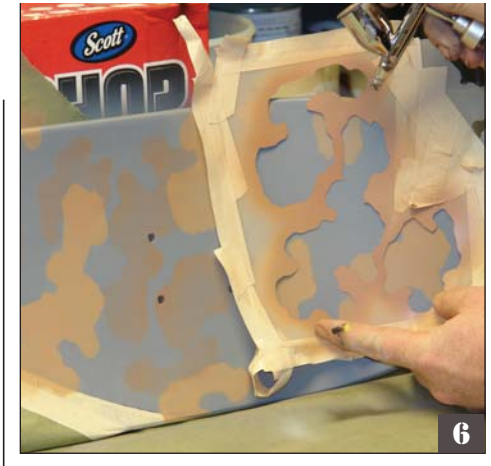
6. With a mix of basecoat White, Black, KK-08 Tangerine, and KK-07 Rootbeer, I created a cool burnt sand color. This will work nicely for my oldschool camo effect. The stencil is none other then the "Ol' School" Camo from the same FX-4. Again, the varied patterns are created merely by going full strength on the spray, or by half-toning it in a fog.