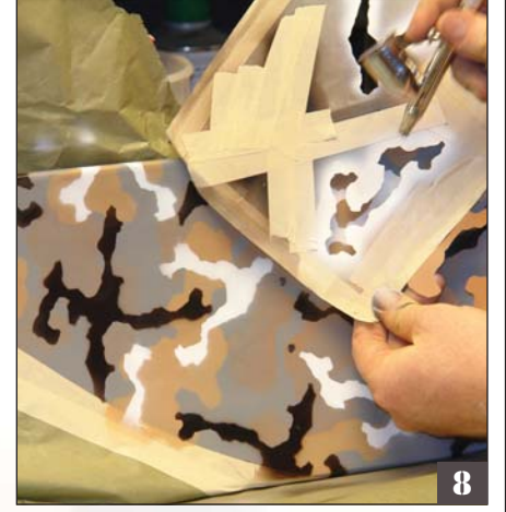
8. The final pattern with the camo stencil is the white. For this one, I used the smaller isolated design. You can easily mix and match the varied patterns on these stencils by masking off the ones around the one you want. Heck, you can even use your tape to mask them in half, creating other patterns.