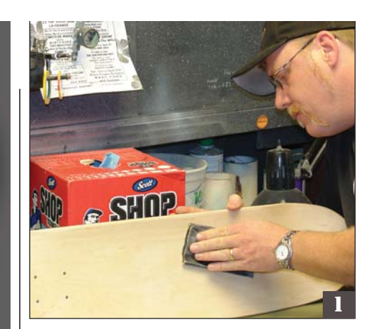
1. Since this board already has a thin layer of lacquer clear over the screened artwork, I do not need to reseal it. A little dry sanding with 600-grit paper and the board is ready for artwork. The screenprinted logo came off with hardly any work. I always appreciate such gifts.