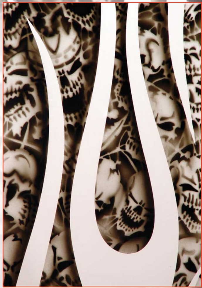
Here you have seen the variety and versatility of stencils. The Frontal II is a good example of a freehand stencil that is limited only by your imagination. The more detailed Lucky 13 can be only minimally modified by freehand work, but does not preclude you from creatively incorporating it into your design. Which stencil is better? Neither ... and both. It all depends on what you need.