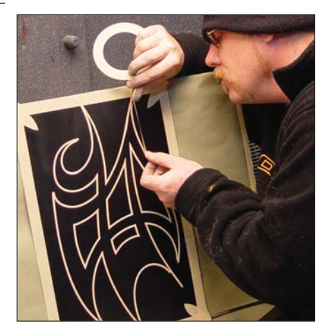
STEP 1. For this article, I took a break from flames, and chose to go tribal. Using my favorite 3-M 1/8-inch crepe fineline tape, I layed out an interesting crossover tribal graphic. Nice thing about the crepe tape is you can reposition it as many times as you wish with little, if any adhesive residue.▼

In the previous column we demonstrated Dragon Skin from the FX-II stencil series. For this installment we're staying with FX-II and going in-depth on Dolla Bill and The Blob . Both are considered "point-and-shoot" stencils, requiring little, if any, freehand skills to paint with. You literally just point at 'em and shoot 'em! These are the fastest of the stencils, and they're excellent as background space fillers, and for embedding designs into your graphics, flames, or murals. Here are some of the advantages of my stencils versus the computer-cut variety: With adhesive-backed stencils you run the risk of delamination, and tape-tracking of your underlying paintwork. Also, there's the pesky vinyl weeding. Besides, if you've ever tried to accurately lay down a sheet of adhesive vinyl, you know how much fun, in reverse, it is. Well, enough yapping, and let me show you an advanced graphic effect that's easily accomplished with these simplest of stencils. Paint on !