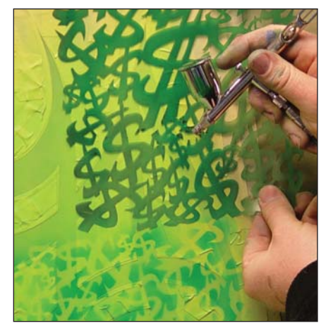
4. I added KK-09 Organic Green and SG-100 to the previous Limetime mix for a killer dark green kandy pearl. After positioning Dolla Bill, I simply sprayed away. With no freehand work required, it's literally the easiest point-and-shoot tool in kustom painting. ►