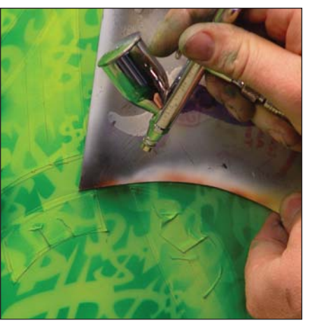
5. Using the FH-1 freehand shield, I airbrushed the drop shadows to show the cross-overs of the tribal graphic. By adding a few drops of BC-25 basecoat black, I get a perfect shadow color. Remember, no shadow is truly black, but a little black added into the background color works nicely. ➤