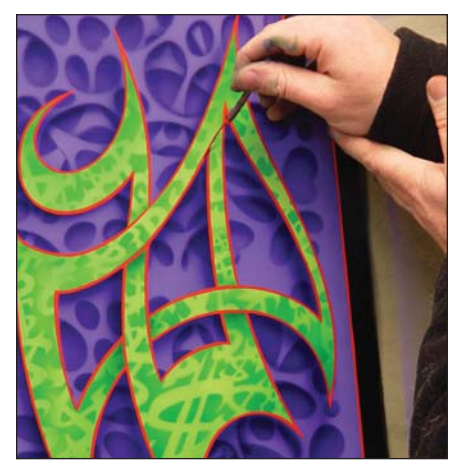
12. With everything unmasked, the only thing left to do is to stripe the design. The ultimate compliment of violet and green is orange, especially if you want to make the design really stand out. So, with my trusty X-Caliber 00 striping brush and HoK orange striping urethane, I outlined the tribal design and its border. The TR-1 gun kept the edge so low that I was able to stripe right over the graphic without having to use a leveling clearcoat. ➤