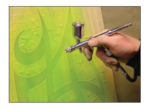
3. Next, I used PBC-39 Limetime Pearl—a lime green basecoat mixed with gold pearl, and over-reduced—and using the same fan gun, sprayed over the yellow for a very bright green result. Thanks to transparent paints, this is easily accomplished. ►