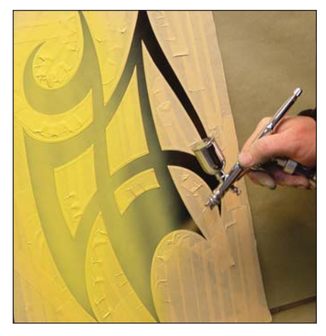
2. I masked off the design, and airbrushed an even layer of HOK SG-101 Lemon Yellow with an Iwata fan head trigger gun. This latest of the Iwata TR line of guns is very unique with its twohead system that includes a standard airbrush head and a fan-pattern head. ▼