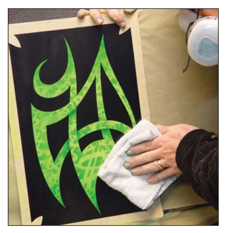
6. Giving the airbrush work a little time to cure, I unmasked and wiped down the entire piece. A little pre-cleaner with water on a soft cloth towel removes any unwanted overspray, and adhesive residue from the background color. I perform this step every time I unmask or change colors on a job, and it also keeps the surface clean by preventing overspray from piling up. ►