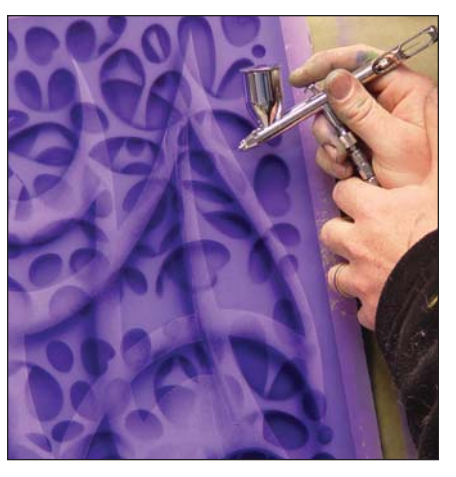
11. Adding the same black to the violet, I airbrushed a killer drop shadow to really punch out the graphic from the background. Back-masking the graphic and spraying the background second is great because it prevents any drop shadow overspray from getting on the graphic. ➤