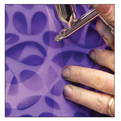
10. Notice the dots in the overlaps of the stencil. A little freehand work is all that's required to eliminate the transition areas and to add some serious depth to the piece. Except for the fan-patterned TR-1, I used the Iwata Eclipse CS for this stencil and detail work. Top-feed airbrushes make it very simple for mixing colors on the fly. ►