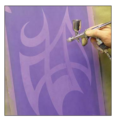
8. I mixed HoK PBC-40 violet pearl with BC-26 white to make an opaque pastel violet pearl base that will cover the black quickly. Mixing a little white in a color as the initial base allows it to cover much faster then multiple layering. ►