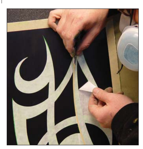
7. Using AutoMask from Coast Airbrush, I masked off and cut out the design, leaving the background exposed for the next color. I use the Automask over masking tape on fresh graphics because it's less tacky and doesn't leave tape tracks. ►