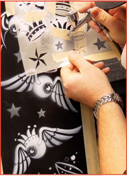
STEP II. With the flying eyeballs finished, I filled in the areas between them with a few nautical stars and other goodies. You may render the stars in dark or light depending upon your background value. Martini Time includes three stars, so knock yourself out.