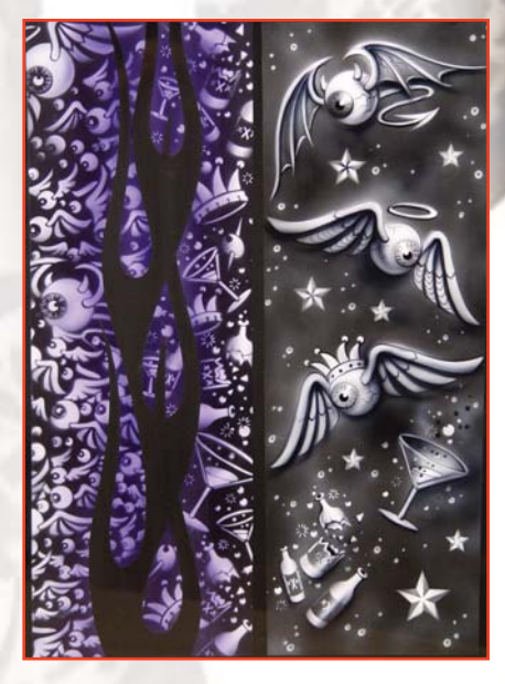
Well, there it is! A cool way to combine two of the newest stencils to hit the market. Whether you use them solely as a background graphic or to lay out a freehand piece of mural work, these new Artool stencils are definitely going to give your latest masterpiece the desired Kustom Kulture look.

Tune in next issue for another edge-of-your-seat stencil adventure. If you have any comments, suggestions, or requests, please submit them to Craig Fraser at Fraser@gotpaint.com