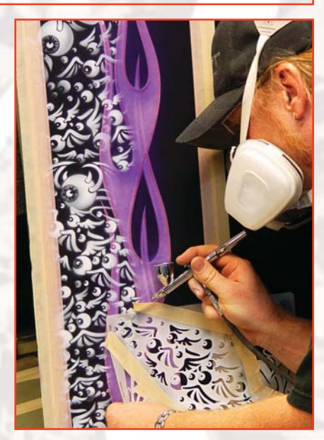
STEP 3. I mixed HOK Violet Pearl with some BC-26 white, and airbrushed the eyeball pattern with the Flyball stencil. I used a combination of the large flying eyeballs and the smaller ones to create a cool landscape of eyeballs. Hot tip: You can achieve the appearance of an unending pattern by simply rotating the stencil.