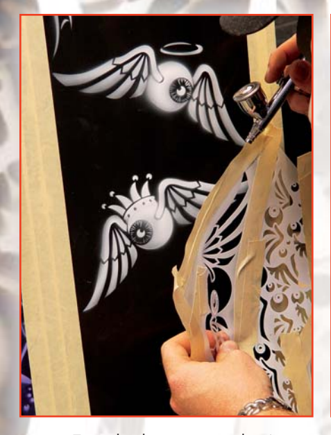
STEP 10. To make the crown work, it's necessary to mask off the halo on the Angel Eyeball—when done correctly, it looks like it was made for it. Again, mask around the stencil to prevent overspray. The masking also serves to hold the stencil to the surface for handsfree spraying.