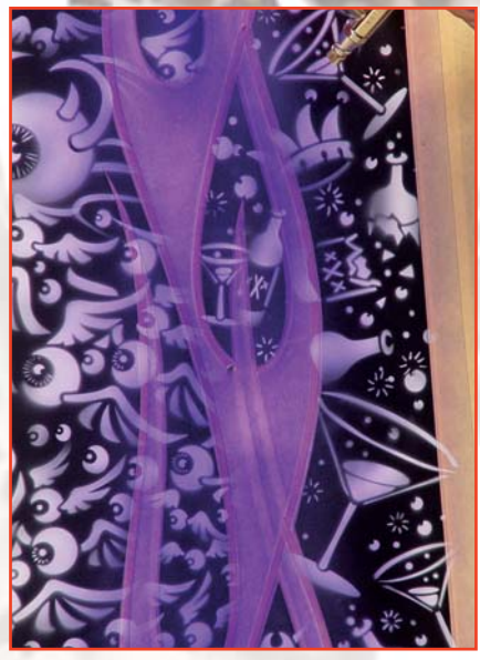
STEP 5. Here, I wanted to show the stencils used solely as a point and spray tool—little skill required—without any kustom airbrushing done on the images. Using a mix of transparent violet kandy, I blended the kandy from the center out, sinking the images back into the background violet for an almost ghosted look. These stencils function exceptionally for pearled ghost work. However, pearls never photograph well.