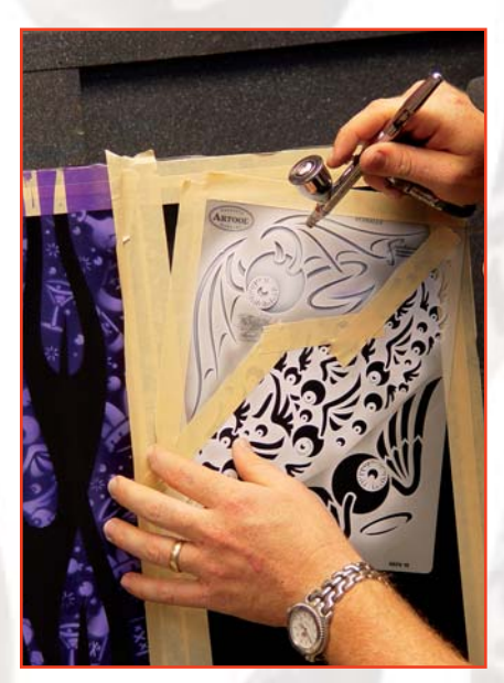
STEP 7. With the background/graphic demo complete, let's take the stencils and play with a little freehand airbrushing. Using the stencils for reference in freehanding allows you to airbrush the tell-tale stencil cuts, giving the illusion of a freehand-rendered design. Using more of the white/violet, I airbrushed the devil eyeball first.