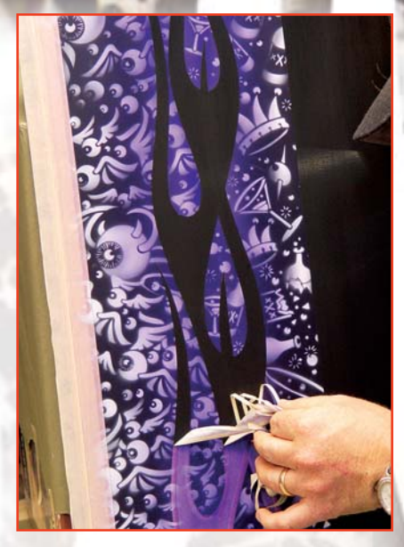
STEP 6. Here, I unmasked the flames to see how these suckers came out. If you want the flames to be less conspicuous, yet stand out more then a pearl job, you can layer in more kandy or you may use the same color as the underlying graphic on your car applying a slightly darker tint.