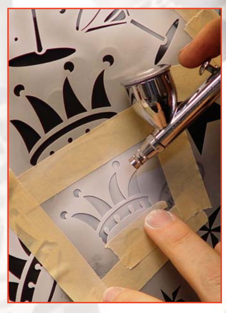
STEP 9. Combining stencils, I airbrushed a crown from Martini Time onto the flying eyeball. Masking off the stencil keeps the overspray to a minimum. You would be amazed by how many of the Artool stencils work together; some by design and others by sheer coincidence. The fun part is experimenting with them.