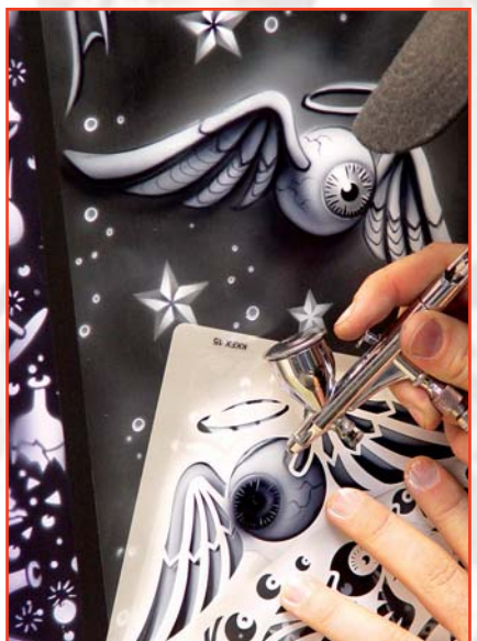
STEP 14. With the Flyball stencil, I brought back the pupil and retina of the eye with the black kandy. You can see what just a little bit of freehand airbrushing can do to liven up these simple stencil designs. Just remember, you control how much your stencil art looks like stencil art!