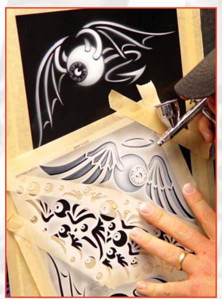
STEP 8. Generally, I lay in all of the stencils to be freehanded before I do any spraying. With the overspray wiped away from the top eyeball, I airbrushed the angel eyeball directly underneath it. Flipping the stencil, I swapped the direction of the eyeball to obtain an alternating effect.