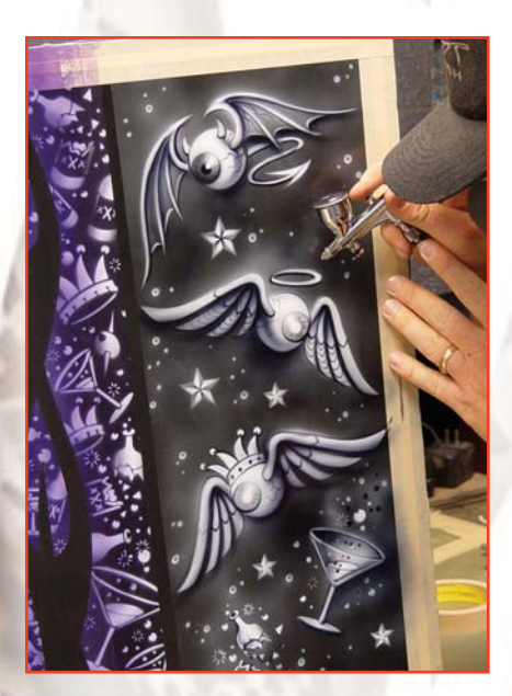
STEP 13. After adding some white background smoke, I connected a number of the stencil breaks with the white. Mixing a batch of black kandy, I airbrushed some details, and added the necessary shadows to give the individual pieces their depth.