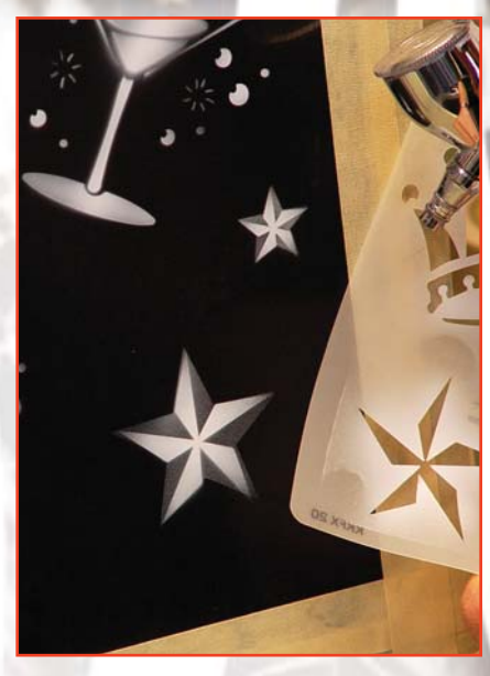
STEP 12. Putting the nautical into the nautical star is my favorite part. A little highlight or darkening in this stencil gives a killer sense of depth. The other stencil's icons are just screaming for a little airbrushing!