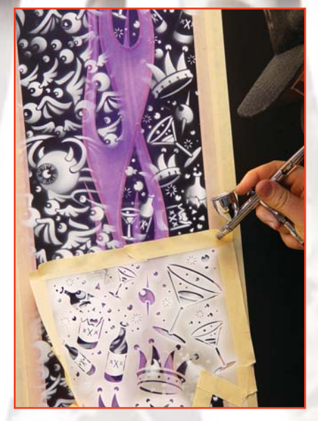
STEP 4. With the same mix of white and violet, I hit the other side of the flame with a nice combination of icons from Martini Time. The cool thing about Martini Time and a number of my background stencils are the multiple sizes to play with. So, if you organize them well, you can create seamless patterns that'll never replicate—and they'll most likely look incredibly bizarre.